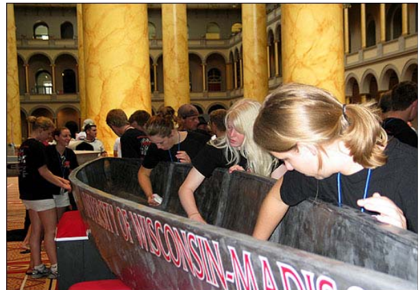
UW-Madison cleaning canoe.