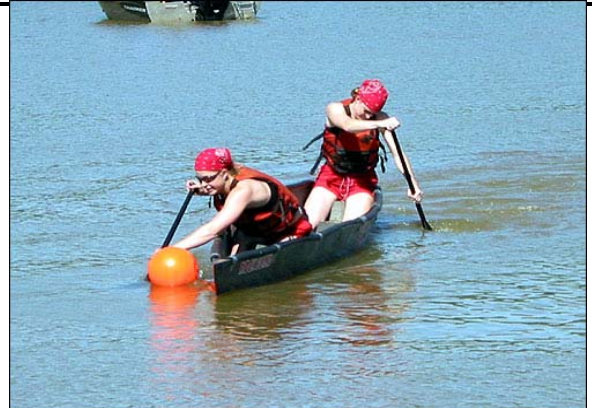
UW-Madison Women's Sprints