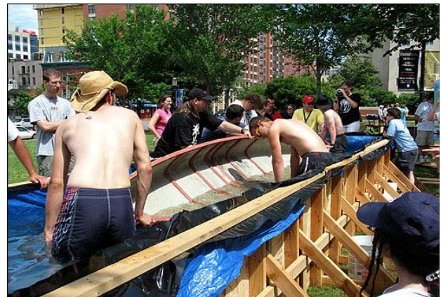
MSOE "swamping" canoe.